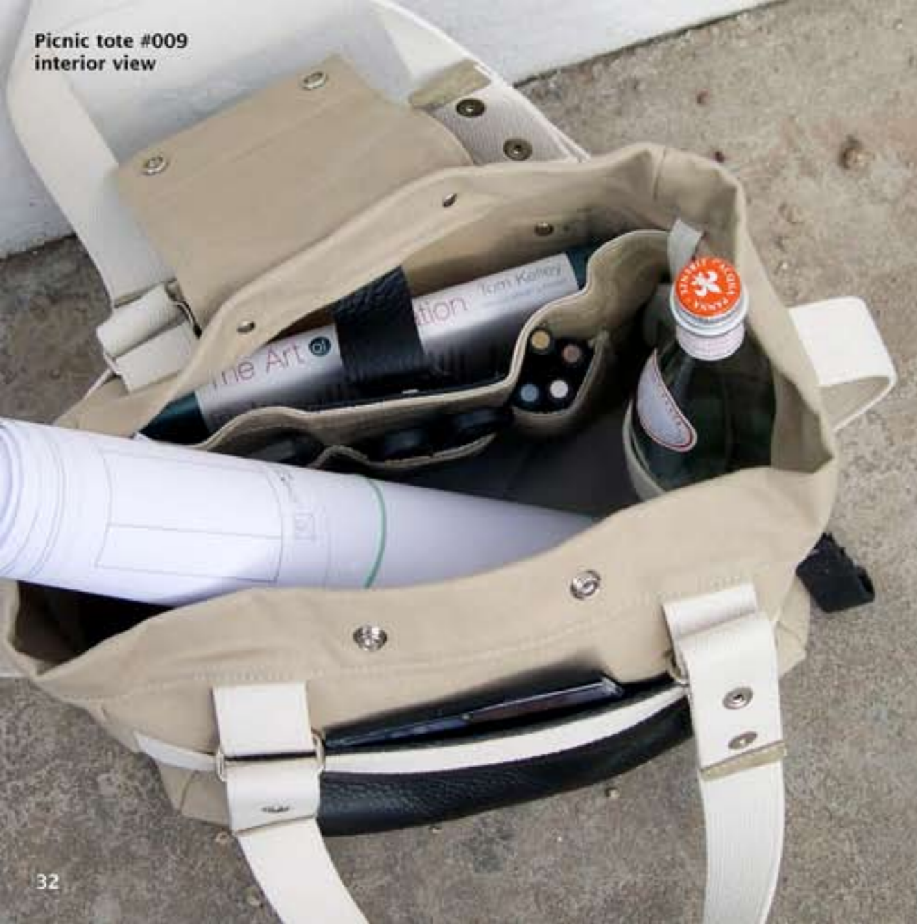
Picnic tote #009 interior view