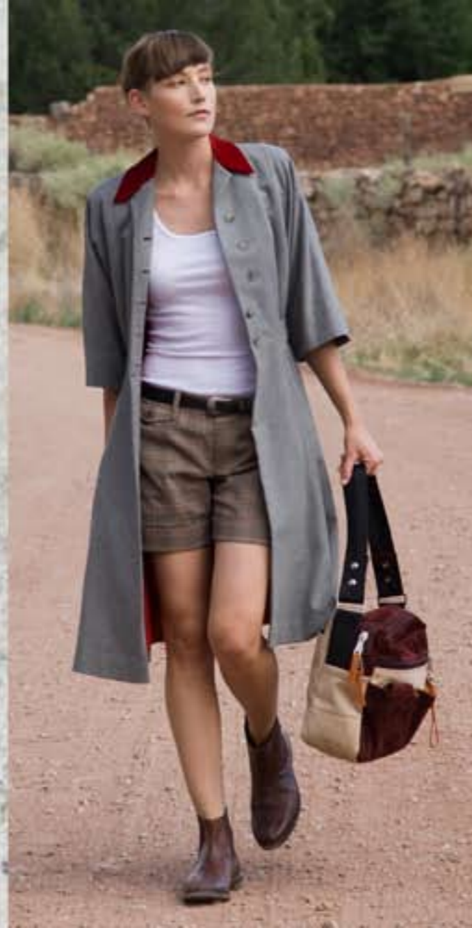
Small Work Case #016 tan canvas, wine with adobe suede black strap