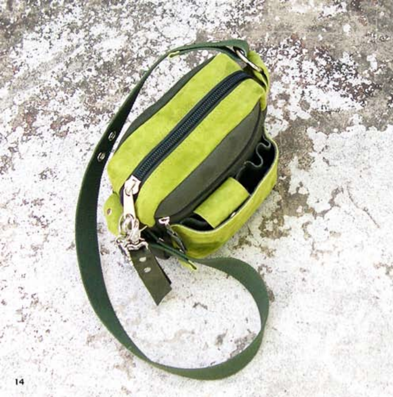
Small Toolbag #004 olive drab canvas parsley with olive suede olive drab strap