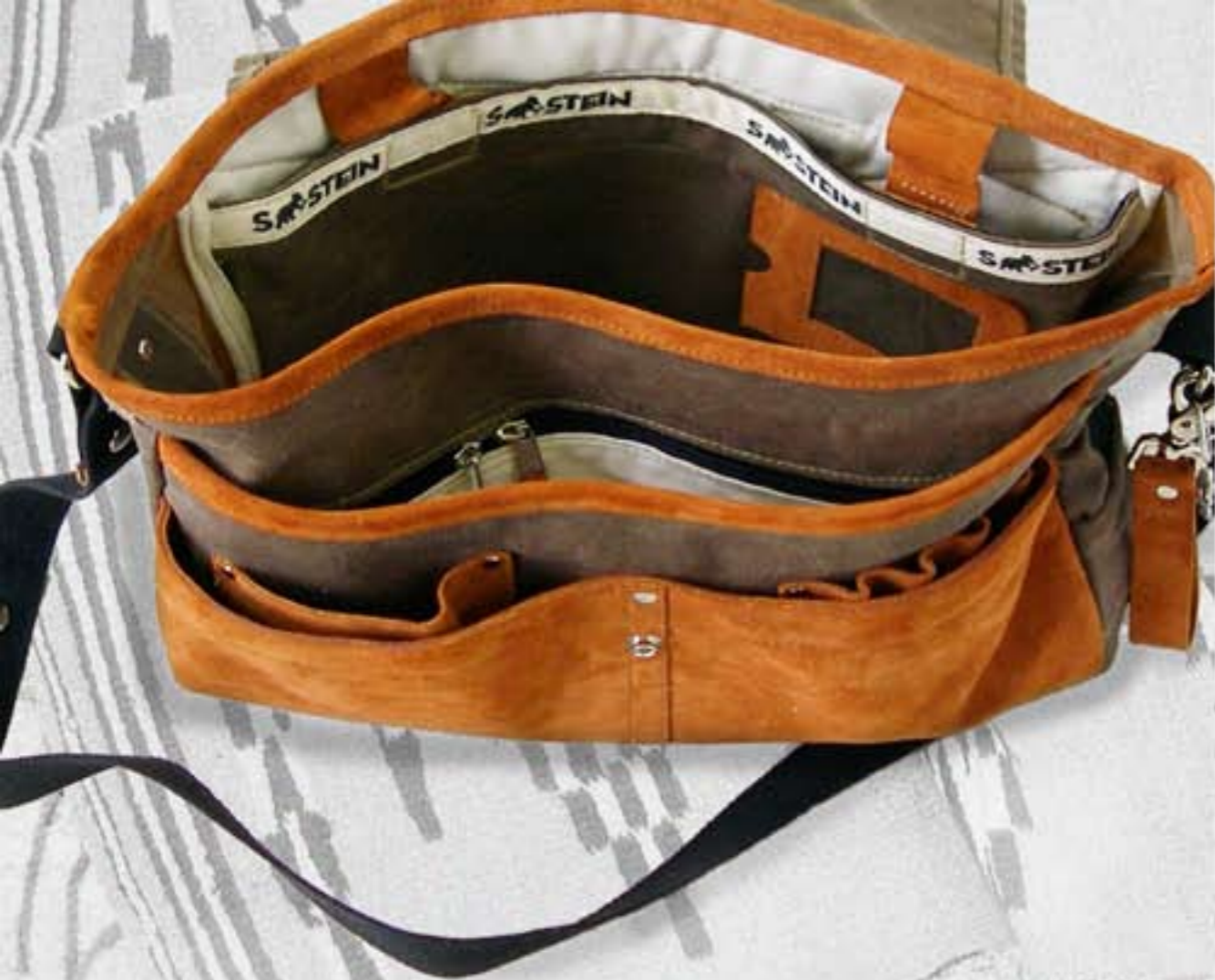
Large Messenger Bag #015 brown waxed canvas, adobe suede black strap