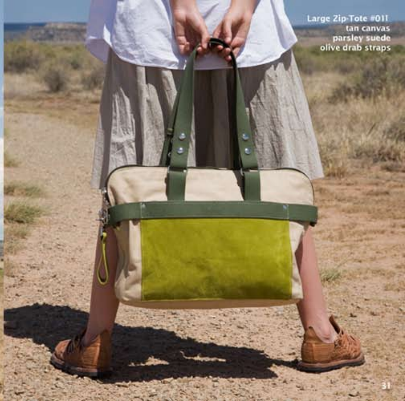
Large Zip-Tote #011 tan canvas parsley suede olive drab straps