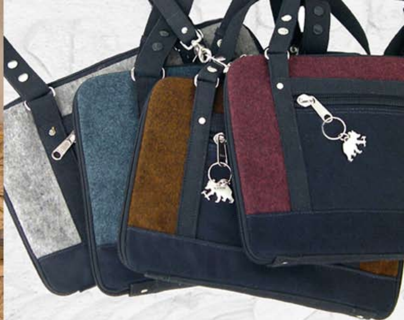
Slim Laptop Bag #C-001 large, #C-002 medium, #C-003 small grey recycled felt or Danish Kvadrat wool felt in blue, tangerine or wine all with black canvas and straps