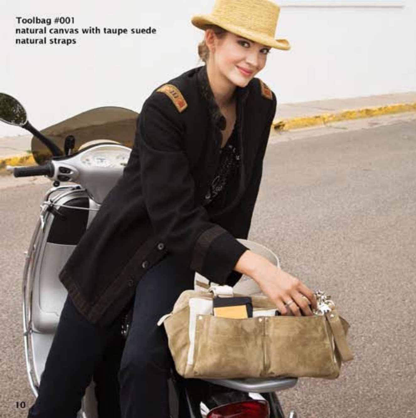
Toolbag #001 natural canvas with taupe suede natural straps