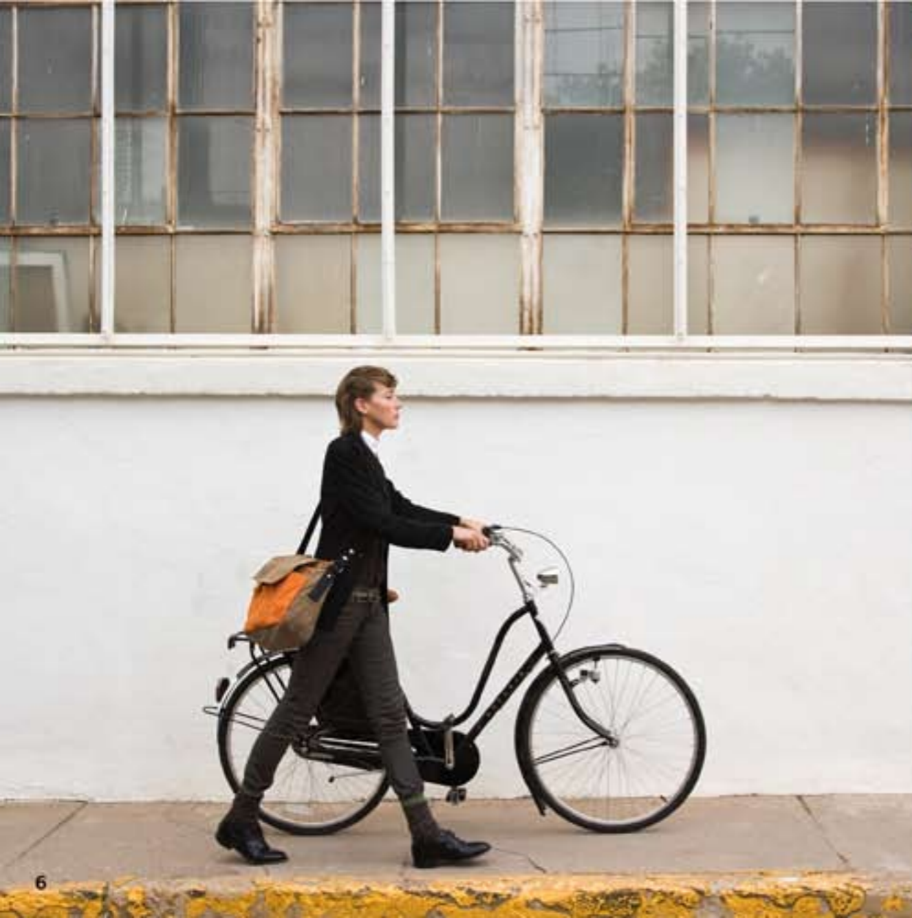
Large Messenger Bag #015 brown waxed canvas adobe suede, black strap