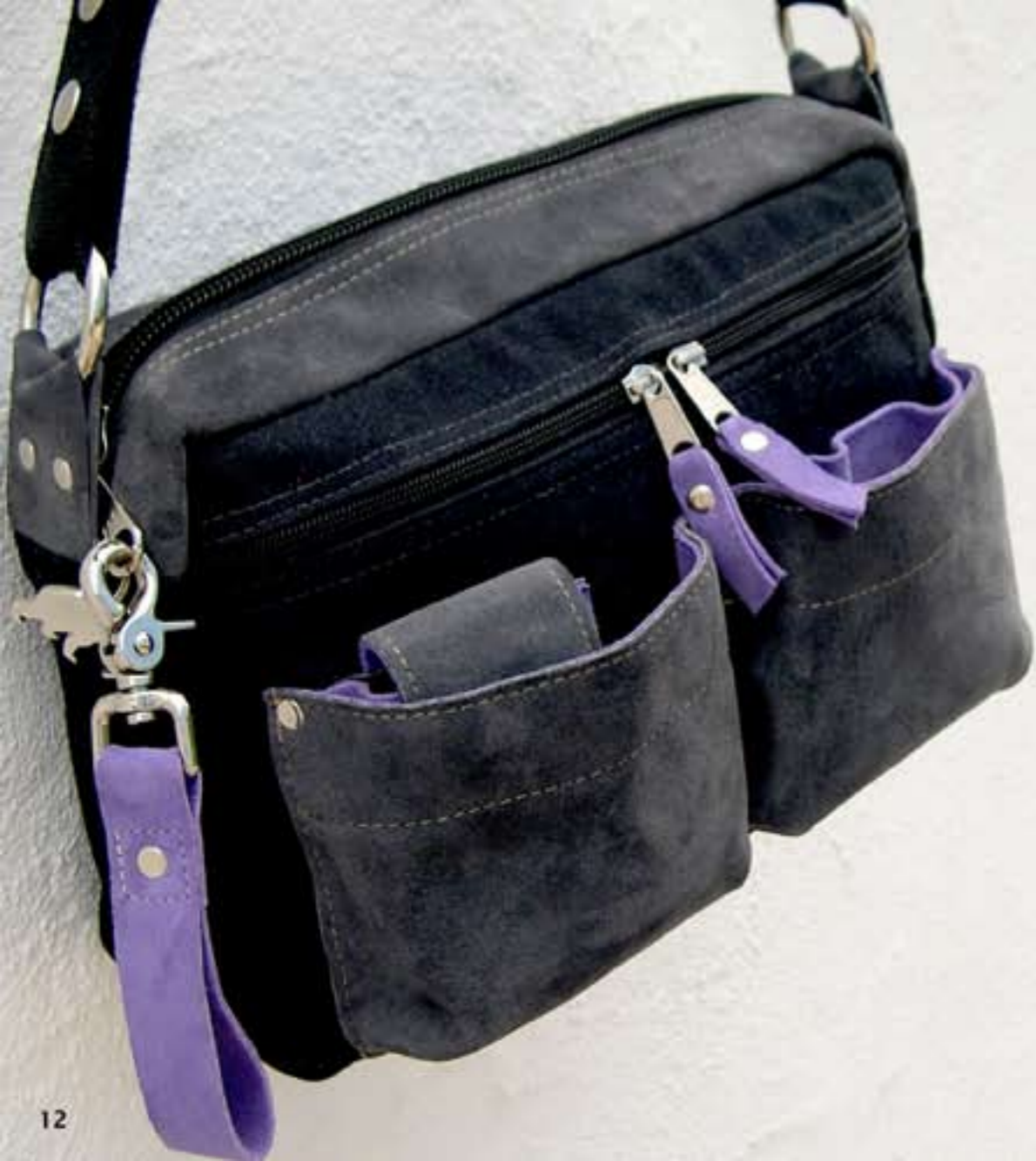
Gearbag #002 black canvas shade with lilac suede